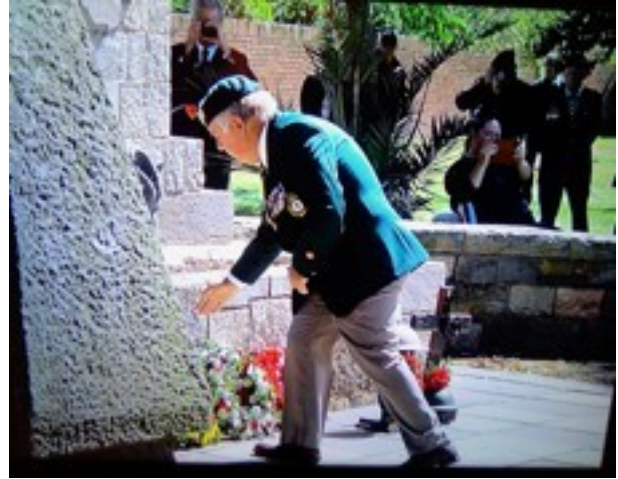
SA Legion Branch Chairman laying a wreath.

after the parade where harmony and comradeship can be enjoyed.