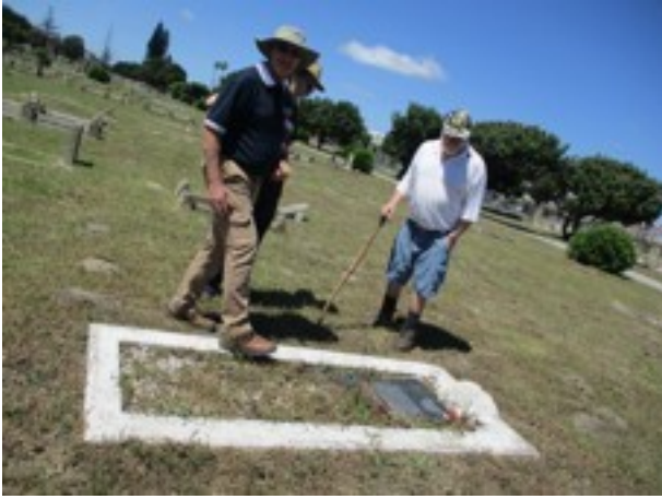
Anglo Boer War Rebel's Grave